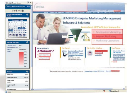
View heat maps of web metrics overlaid over your own web site.